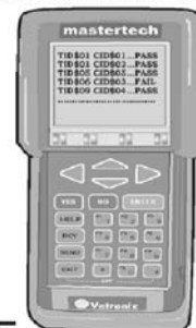
TID = Test ID CID = Component ID